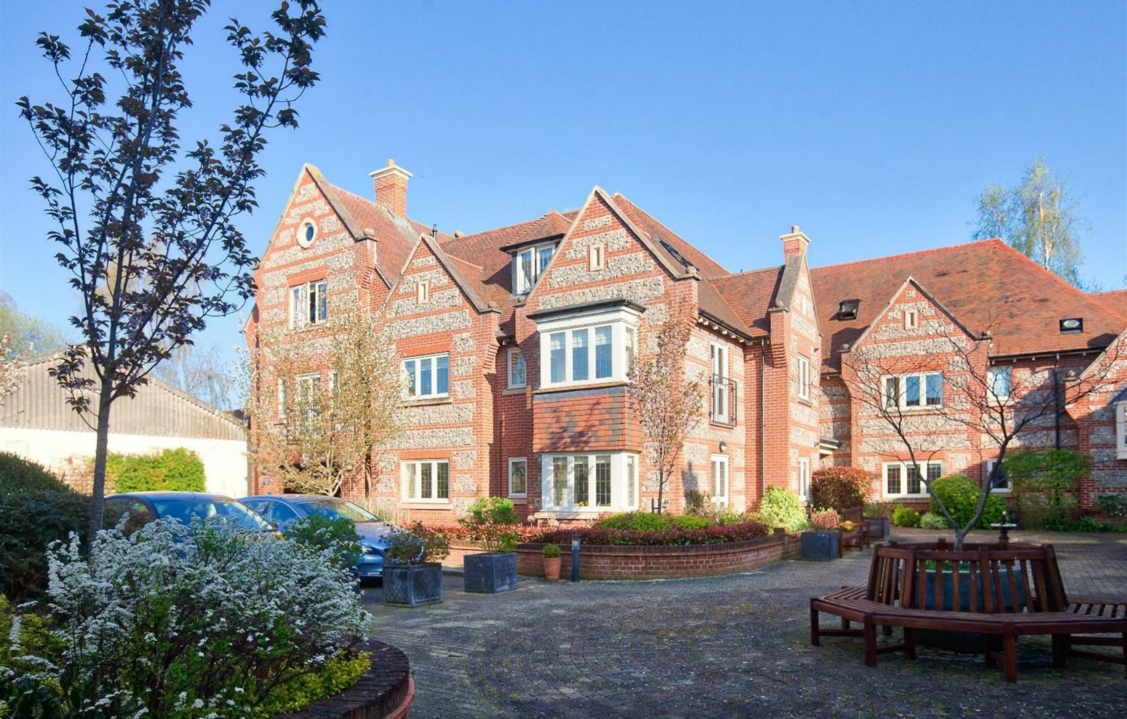
Florence Court, Wilton